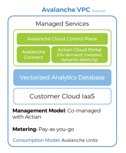
Figure 2. Avalanche offers a flexible consumption model.