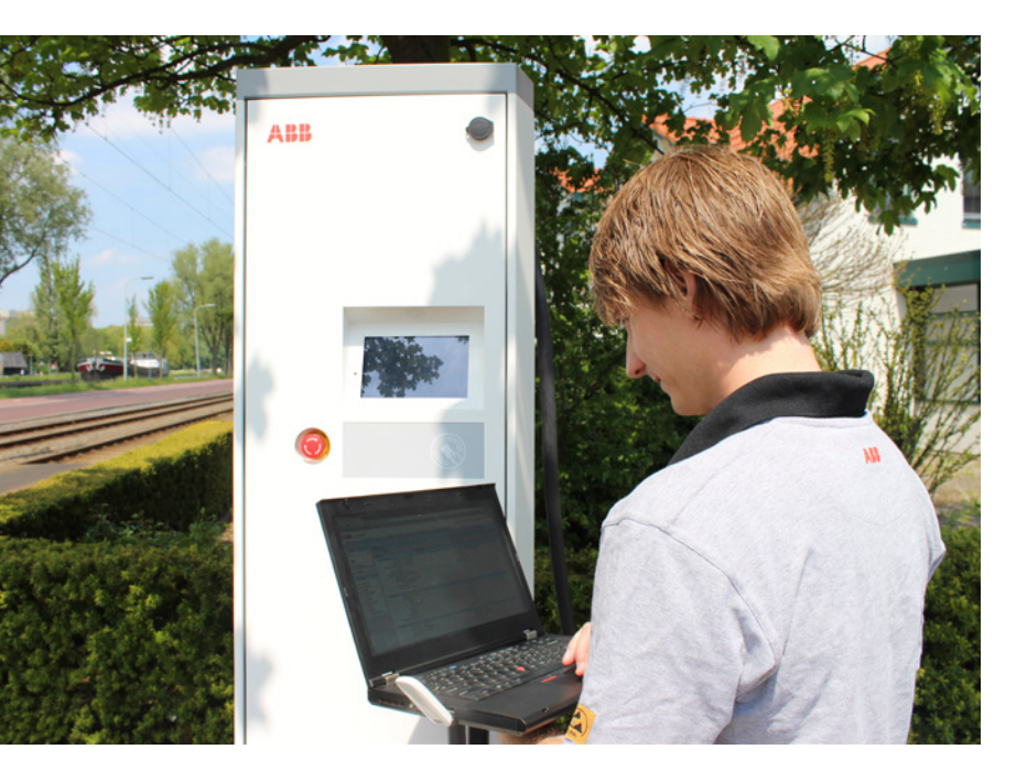
ABB Charger Care

Benefit from ABB's experience and expertise servicing thousands of DC chargers and high power chargers up to 350 kW worldwide.