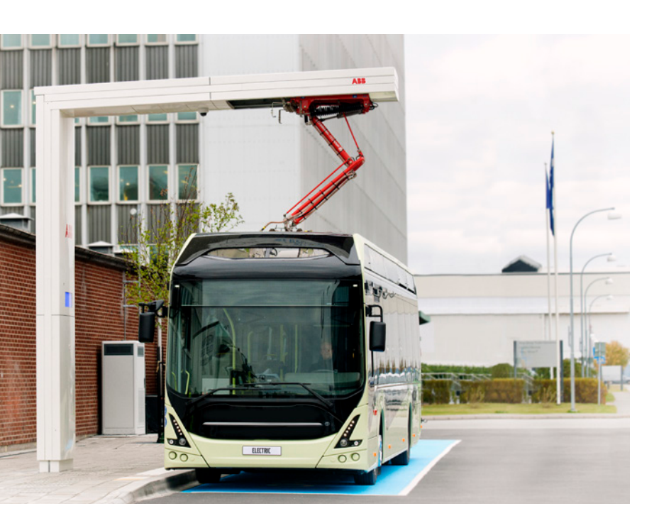
ABB offers an ideal solution to charge electric buses fully automated following the OppCharge protocol. With typical charge times of 3 to 6 minutes the system can easily be integrated in existing operations.