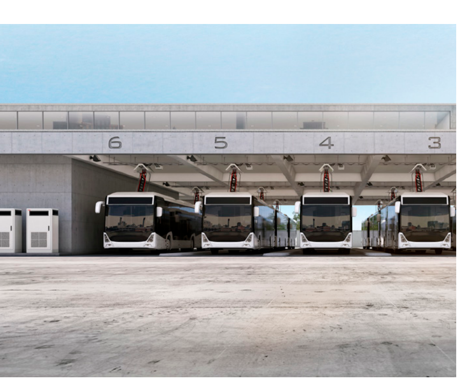
ABB offers an ideal solution to charge electric buses that are equipped with a roof mounted pantograph. This allows to charge larger fleets of electric buses overnight in a range of 50-150 kW per vehicle and during the day with 150-600 kW for opportunity charging.