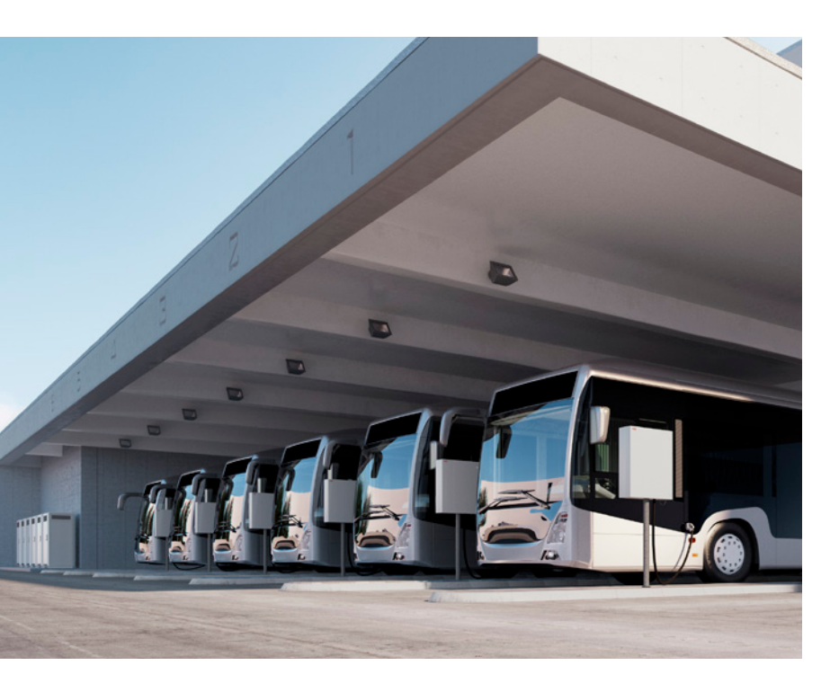
ABB offers a complete portfolio for charging heavy electric vehicles such as buses and trucks with a CCS connector. Due their large voltage range the DC wall box (24 kW) and Terra 54HV (50 kW) are perfectly suited to charge electric buses and trucks. For higher power the products with 100 kW and 150 kW including sequential charging, are specially designed to charge larger fleets of electric vehicles in it its most optimized way.

Charge electric buses and trucks with a connector