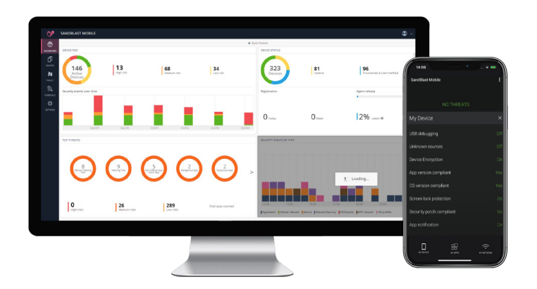
Harmony Mobile Management Console