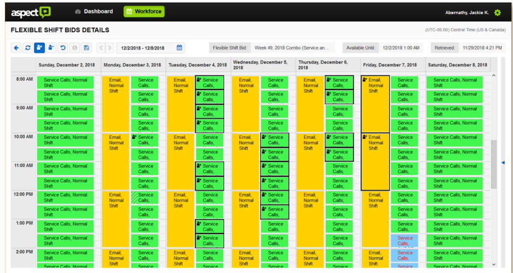
Agent Flexible Shift Bidding Screen

Corporate and Americas Headquarters 2325 E. Camelback Road, Suite 700 Phoenix, AZ 85016 +(1) 602 282 1500 office +(1) 602 956 229 fax