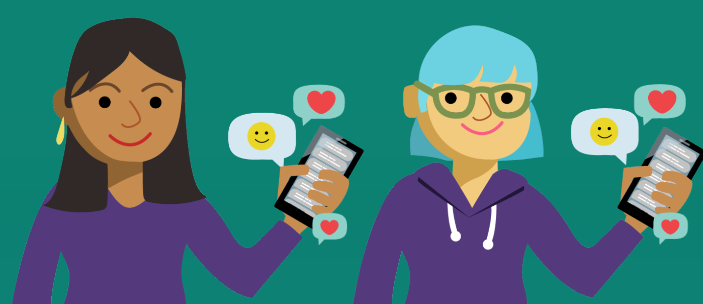
Females experienced a small improvement in DCI

amount females improved their DCI score. Male DCI worsened by 5%