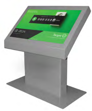
Demonstrate your commitment to sustainability by displaying monthly energy, water, and gas consumption and savings.