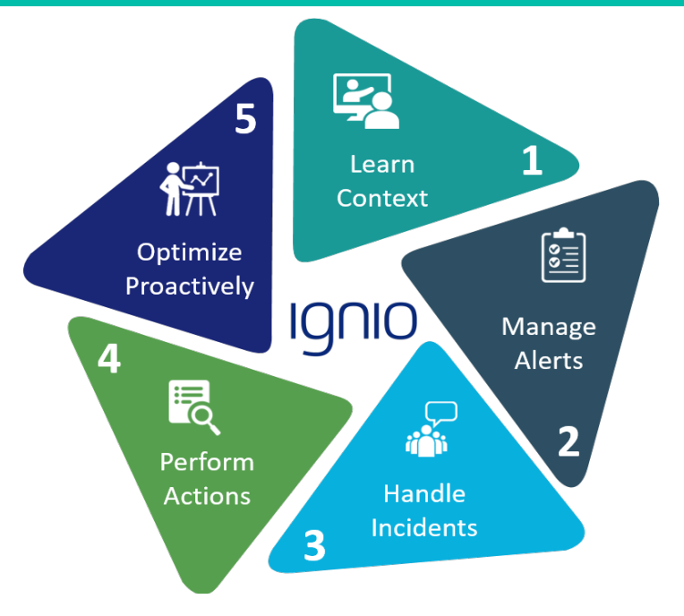
Fig. 1- Core capabilities of ignio™ AlOps

ignio™ AlOps is an Al-driven software that judiciously combines Enterprise IT context, insights and automated actions to deliver resilient, agile and autonomous IT operations while eliminating repetitive manual processes and contentious war rooms. It acts as an intelligent virtual expert that detects and assesses the deviation in system behavior, triages and resolves the incidents, predicts the future state and prescribes actions proactively to prevent any disruptions of datacenter operations.