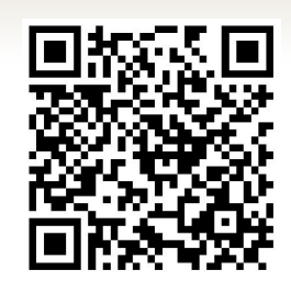
Book a session now to discover more!

TAZI AI Systems Inc. the AutoML Platform that Allows You to Build your No-Code, Explainable Machine Learning Solution in Less than Three Weeks, Or Your Money Back.