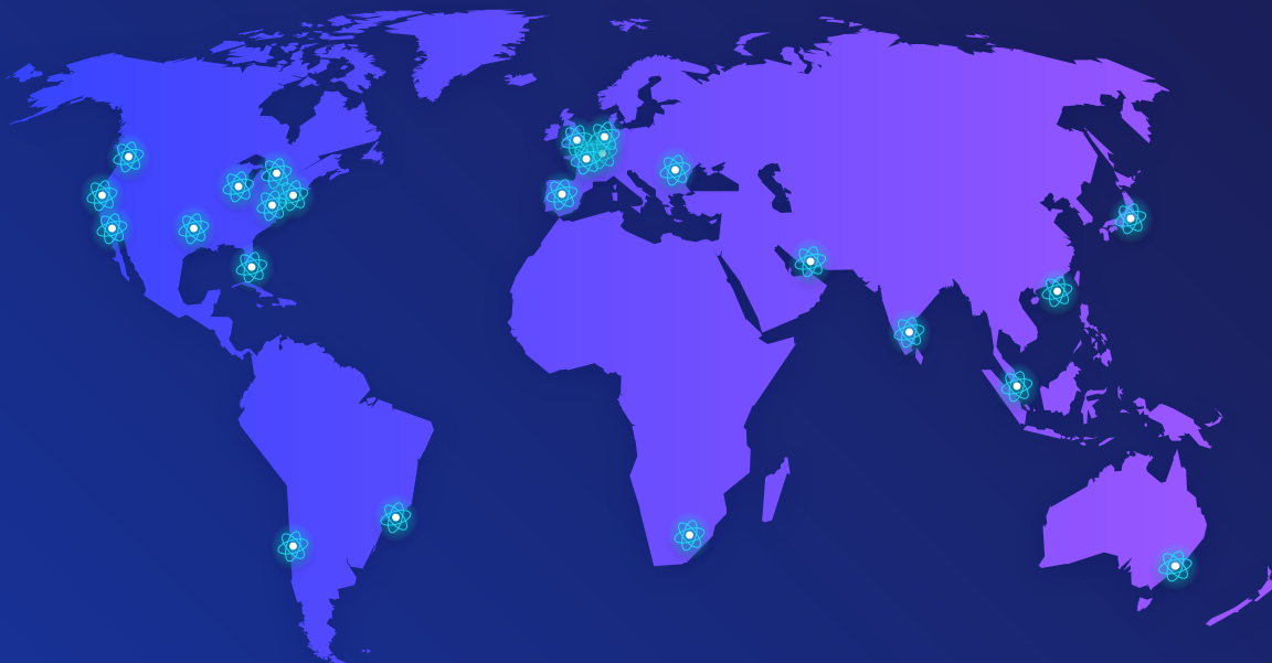
Seaplane Global Backbone Points-of-Presence