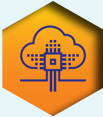
Cloud Security Posture & Risk Management (CSPRM)

LTI Enterprise Cloud Security (ECS) solution is delivered through a collaborative platform that enables businesses to manage their existing multi/hybrid cloud environment and navigate cloud transformation journey in secured & accelerated manner. The key contours of our Enterprise Cloud Security (ECS) services are-