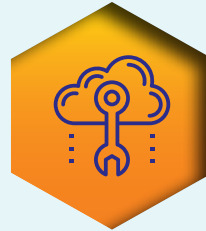
Cloud Workloads Protection & Risk Management (CWPRM)