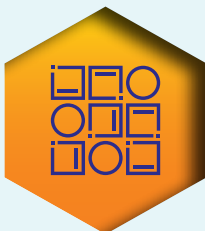
Container Security & Risk Management