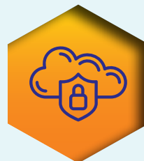
Cloud Defense SIEM