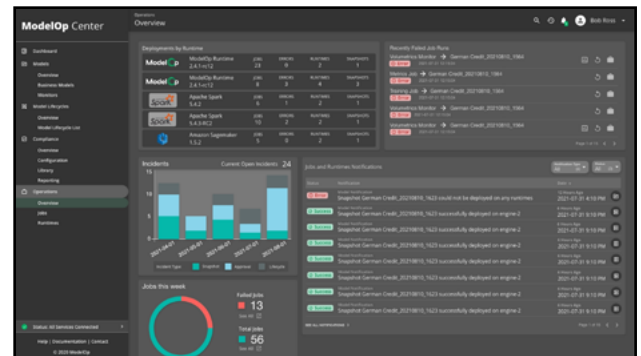
ModelOp Center's Governance Process Automation

ModelOp Center's powerful abstraction layer and modern microservices architecture provide the flexibility to support current and future enterprise AI tools, infrastructure and business decisions and investments.