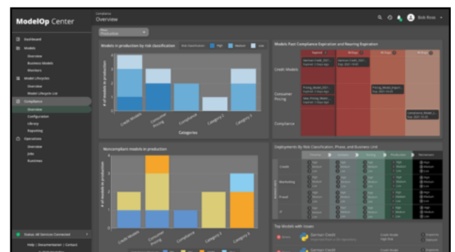
ModelOp Center's Business, Operational, and Risk Visibility for All AI Models

With a 360 view of all production models, you have continuous oversight to ensure expected business value, operational efficiency, and risk and compliance mandates are met. Custom views and reports make it easy for stakeholder-specific insights and audit requirements to be satisfied.