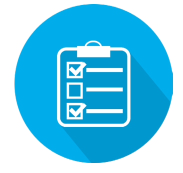
Adoption & user productivity