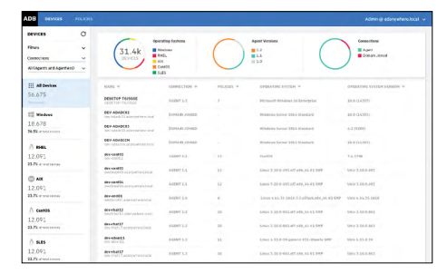
Figure 2. Device Management