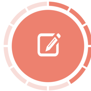
Cloud Migration Assessment & Business Strategy Roadmap