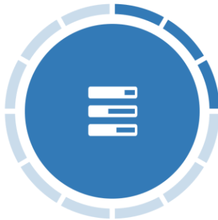
Cloud Readiness Assessment