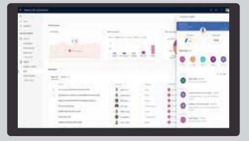
Integrate data for deeper customer insights