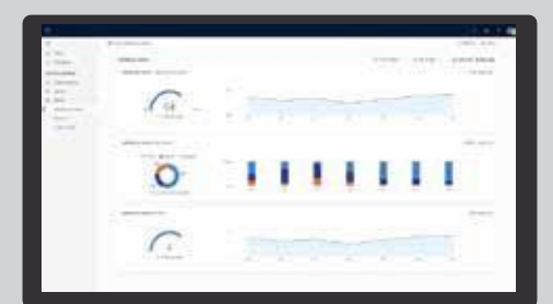
Drive action with real time feedback