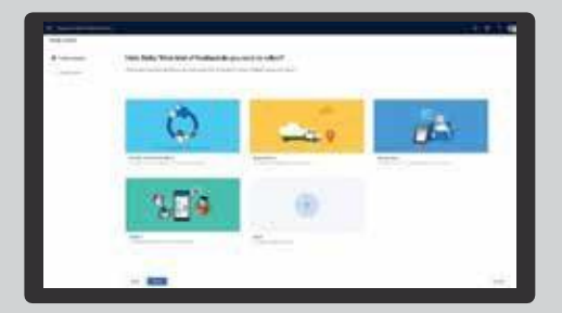
Capture feedback instantly