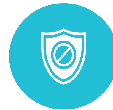
Defender for Identity