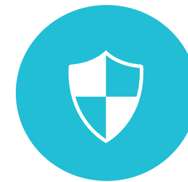
Defender for Endpoint