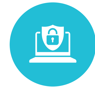
Cloud App Security