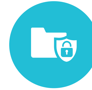
Defender for 0365