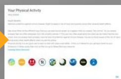
Pick your Devices / Apps

Your Wellness Dashboard – designed to enable you to manage and improve all aspects of your physical and mental wellness