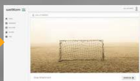
Set your Goals and Actions