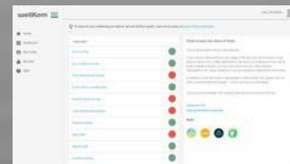
Daily Wellness Habits