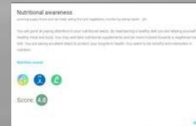
Devices & Apps

Your Wellness Dashboard – designed to enable you to manage and improve all aspects of your physical and mental wellness