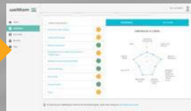
Build your Wellness Dashboard