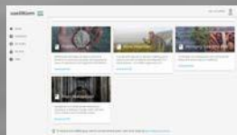
Select Your Solutions