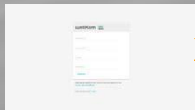
Open Confidential Account