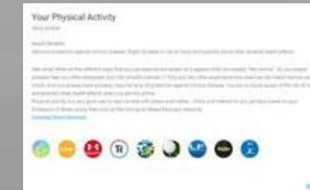
Physical Activity Levels