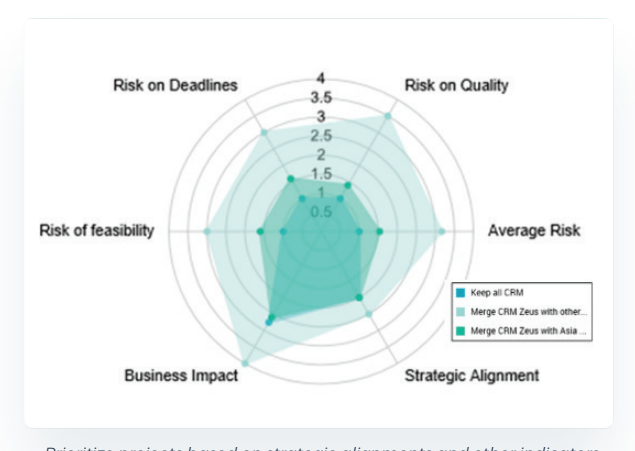
Prioritize projects based on strategic alignments and other indicators