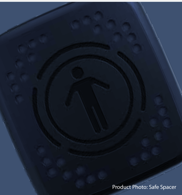
Product Photo: Safe Spacer

Safercontact™ uses proximity-sensing technology that monitors social distance without identity or location information. This way, personal privacy is protected, so employees feel safe, not tracked.