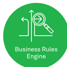
Business Rules Engine