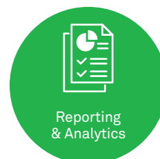
Reporting & Analytics