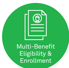
Multi-Benefit Eligibility & Enrollment