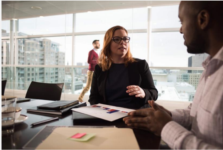
SharePoint Server 2010, 2013, 2017