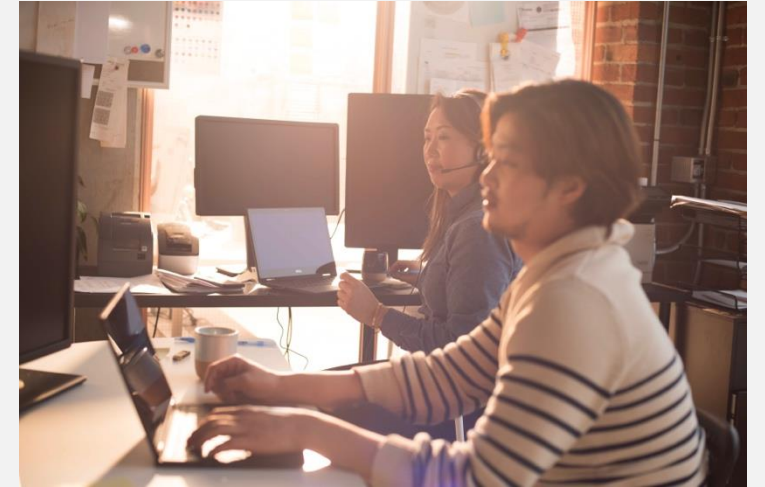
Cloud storage providers