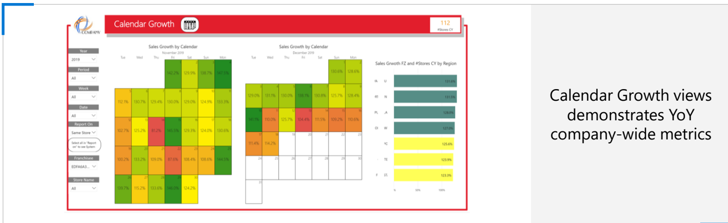
Calendar Growth views demonstrates YoY company-wide metrics

For Prosys, this solution afforded them a degree of visibility into other solutions used by KFC, and provided further opportunities to collaborate with the customer on additional solutions spanning across Finance, Operations, HR, and the Supply chain.