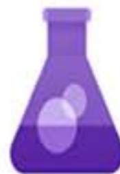
Azure Test Plans

CI/CD that works with any language, platform, and cloud. Connect to GitHub or any Git provider and deploy continuously to any cloud.