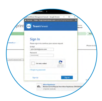
Figure 1: For convenience and security, the first time each supporter uses the embedded TeamViewer functionality, they will be prompted to log in with their licensed TeamViewer account. This is only required once.

Without an embedded remote support solution, supporters spend extra time switching back and forth from their remote support application and Microsoft Dynamics 365. By embedding TeamViewer remote control into Microsoft Dynamics 365, supporters can assist users without switching applications, giving them time to help more users.