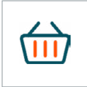
CONSUMER PACKAGED GOODS