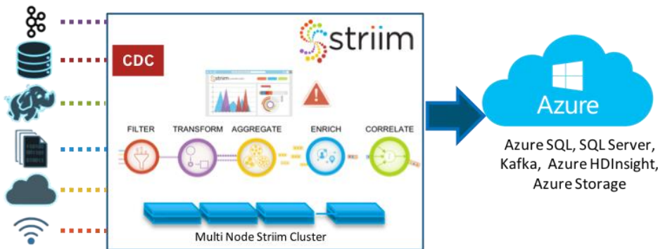
Real-Time Data Integration with Stream Processing and Visualization

The Striim software platform offers continuous and verifiable data movement and stream processing from heterogeneous, on-premises systems and AWS into Azure with sub-second latency.