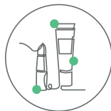
Beauty & Personal Care