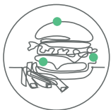
Food & Nutrition