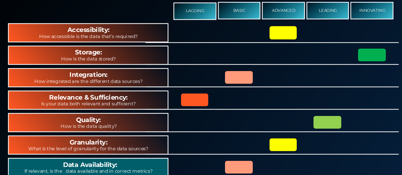
Example: Criteria for Data Exploration