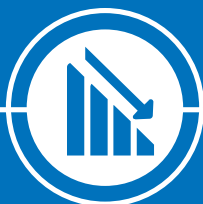
Scalability, Lower TCO