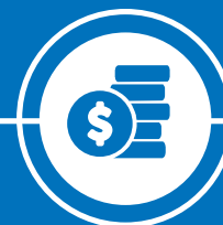
Flexible pricing model

Data management in this digital economy is a daunting task, the need to take care of the exponential growth of data created by digital processes, and to ensure these data are protected from external dangers such as hackers or natural disasters. Because of this, many businesses need assistance in creating a data backup plan to ensure their data is secure and easily recoverable.