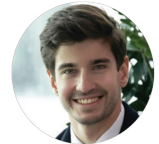
– Manager, Benefits Implementation

I found the team very enterprising, innovative, and committed, with the way they executed their responsibilities, overcame challenges, explored solutions, and solved problems.