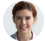
– Manager, Benefits Testing

What I appreciate about Simplify Healthcare is that they anticipate what will be needed to complete the entire project end-to-end, which minimizes late project life cycle budget increases.