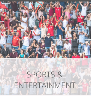
SPORTS & ENTERTAINMENT