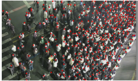
Crowd detection and people counting