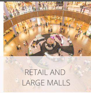
RETAIL AND LARGE MALLS