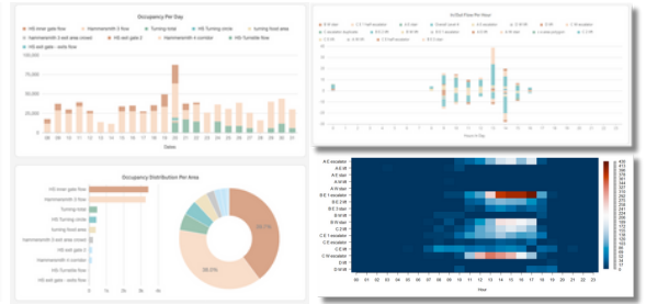
Heat map analytics showing traffic flow