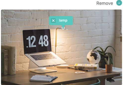
Annotation Task Example