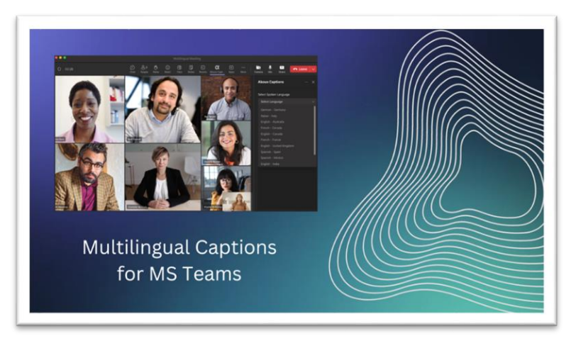
Akouo Captions provides seamless multilingual communication.

Akouo Ai-powered Multilingual Captions is a 100% Microsoft-technologies solution that makes your meetings seamlessly multilingual. Akouo Captions allows people to participate in a Microsoft Teams meeting in the language of their choice; all other spoken languages are rendered in the selected language in real time.