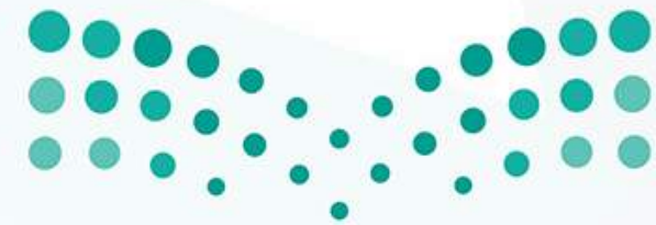
Ministry of Education