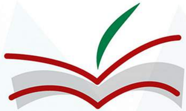
Lebanon Republic Ministry of Education and Higher Education