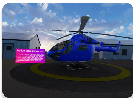
Immersive Training & Visualization