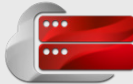
Cloud HSM Financial Issuing