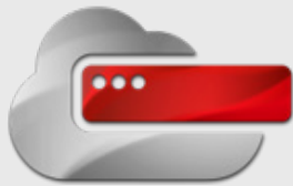
Cloud HSM Financial Acquiring