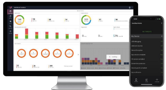
Harmony Mobile Management Console

Easy to manage: a cloud-based and intuitive management console provides the ability to oversee mobile risk posture and set granular policies. Harmony Mobile also expands your mobile application deployment security by giving administrators an application vetting service, allowing them to upload or link applications (both Android or iOS) into the Harmony Mobile Dashboard and receive a full app analysis report within a few minutes.