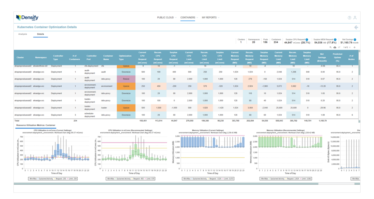
Densify automatically analyzes thousands of containers to determine optimal settings