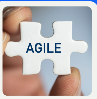
Integration Platform Manage velocity with ease