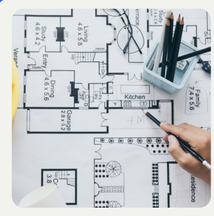
Super Dev Platform Develop and deploy faster with bulk prompts