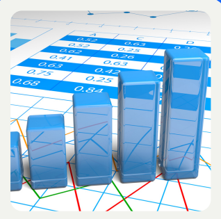
Team Platform Granular project plan & estimations.