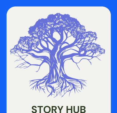
Product Story & Collabotaion