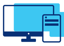
App and workflow integration

... with the savings, support and simple flexibility you need.