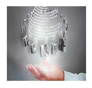
Build & Migrate

Rather than being a blocker, make security & compliance an enabler of your digital future by integrating security from the start