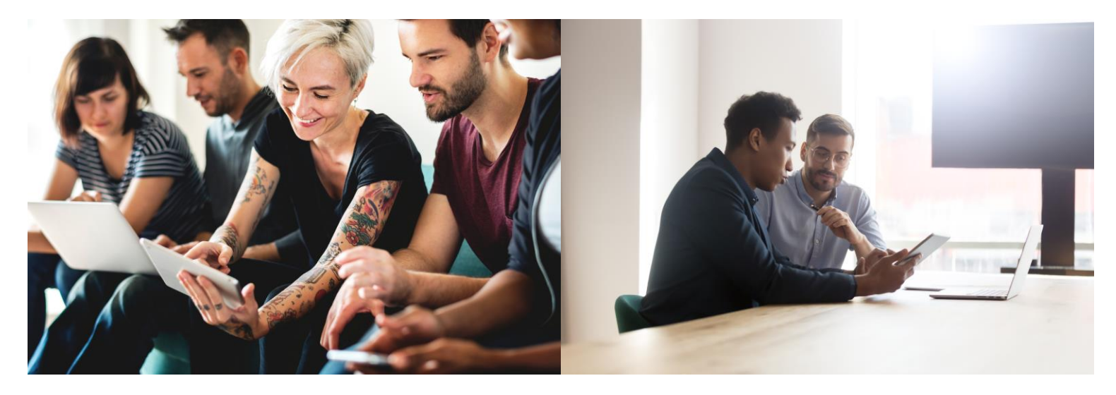
Liked by user