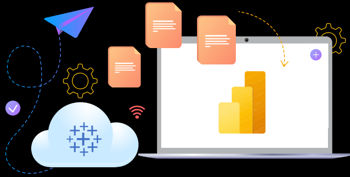
Tableau data visualization and reporting platform are widely deployed across many organizations. However, several enterprises, including Fortune 500, are planning to migrate from Tableau to Power BI due to its increasing cost, higher maintenance efforts due to the need for a unified semantic layer, and persistent performance challenges.

Leveraging our extensive expertise in Power BI migration solutions, WinWire has developed tools and automation frameworks that effectively reduce migration costs and risks.