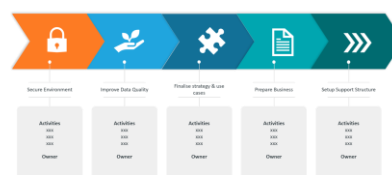
Figure 2 - Copilot Adaptive Roadmap