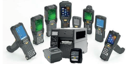
Certified Zebra devices include ET51, MC22, MC33, MC93, TC26, TC52AX, TC57X, ZD400 and ZQ500.