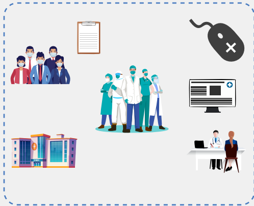
Raw Data Onboarding