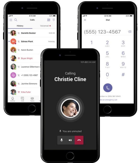
Make and receive phone calls as a native part of the Teams experience – desktop or mobile