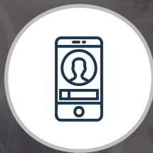
FACE RECOGNITION & STAFF SELF SERVICE APP