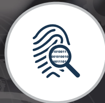
FINGERPRINT/ FACE RECOGNITION