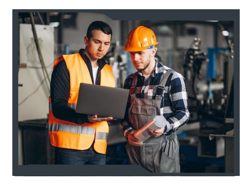
In-house solutions are limiting technology innovation

We collect and store data in multiple systems (e.g., MES, ERP, QMS, etc.). Pulling data together by hand is difficult and time consuming.