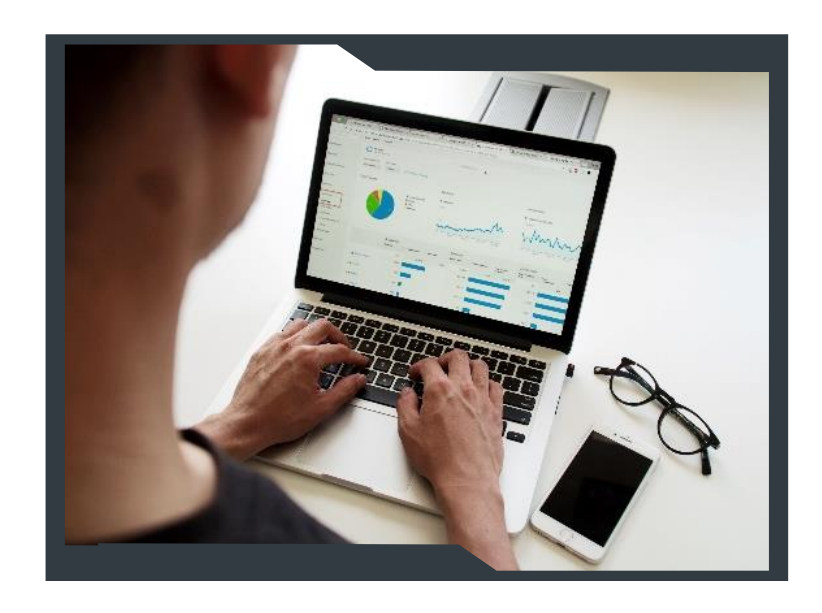
Pressure to increase production efficiency, which also can boost sustainability

Our network has a complicated architecture and includes some custom code. It's difficult to develop innovative Industrial IoT (IIot) solutions with our current stack.