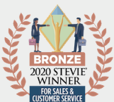
"Station Dedective" Best Use of Technology Stevie Sales & Customer Service Awards, 2020

TANI has many awards regarding its use of AI & ML in Analytical Services both in local market (Turkey) and Internationally.