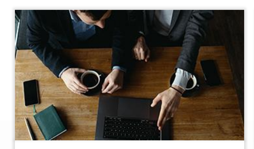
Technical readiness assessment report